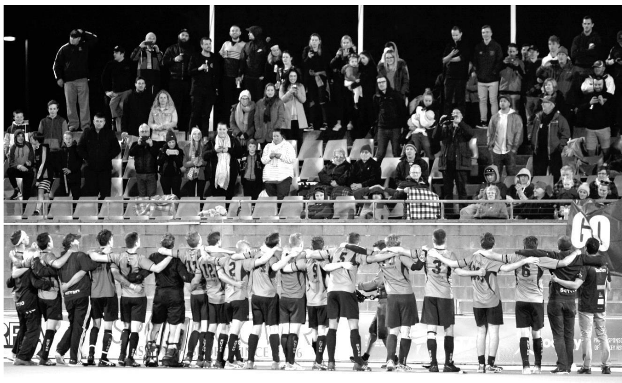
Brothers In Arms