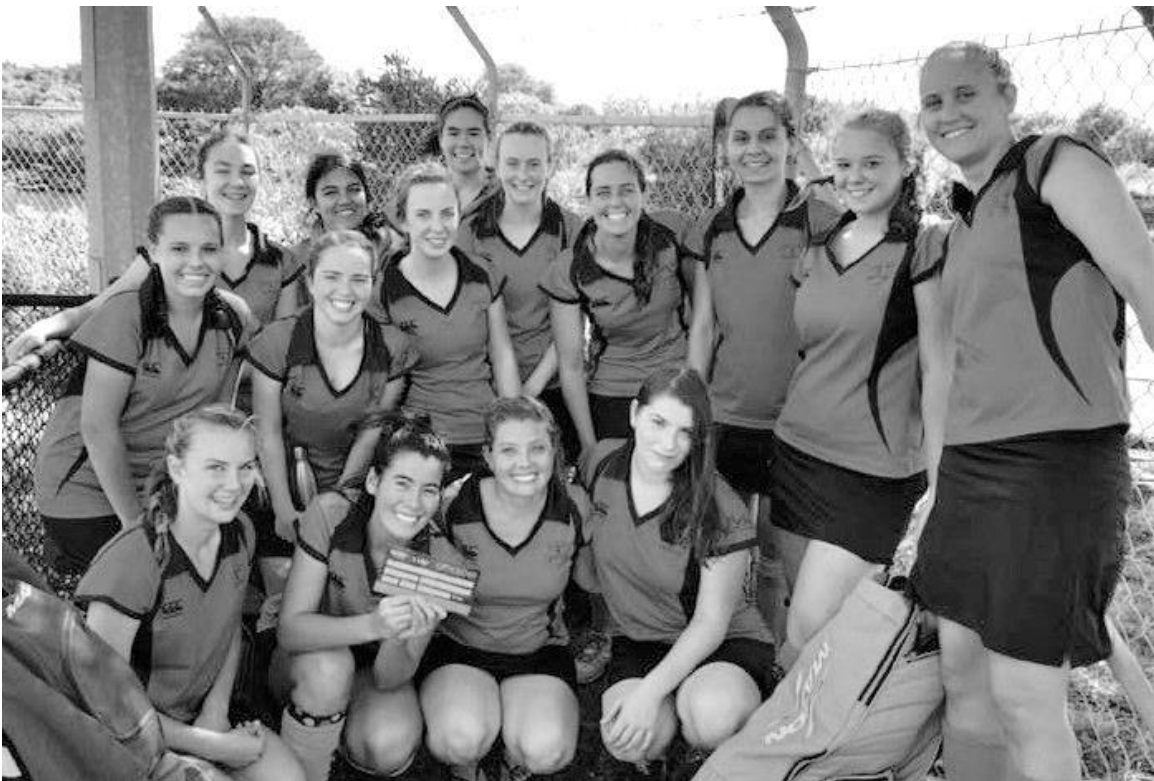
SEHA Women's 2 nd Division: 5 th

This year's team finished 5 th , missing out on the finals this season. Our team was one of the youngest teams in the competition with 8 of our player's still playing junior hockey. However it created great opportunity for our younger players to learn from our more experienced players in the team and to challenge themselves in a senior competition. This year could be described as a building year for the 2 nd grade women's, and we look towards next season with great enthusiasm knowing that we will only get better and better. We came into